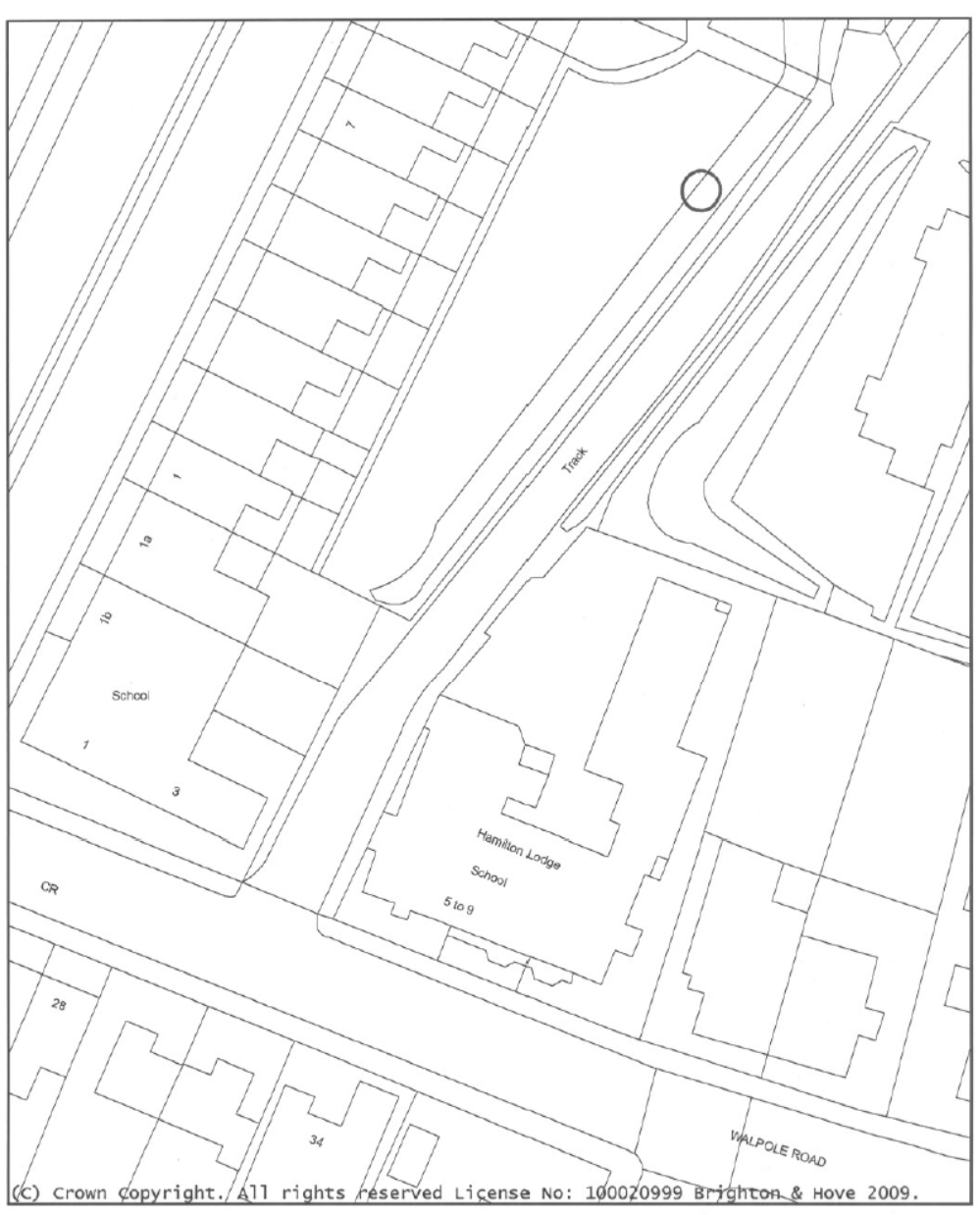
BH2009/01695: Hamilton Lodge School, Walpole Road